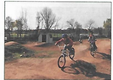
A bicycle pump track is a continuous loop of dirt berms and "rollers" (smooth dirt mounds). The rider's upper and lower body's pumping motion maintains the speed around the track, ideally without pedaling.

We welcome your input at: info@granada.ca.gov