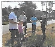
Mountain Biking Quarry Park, far left