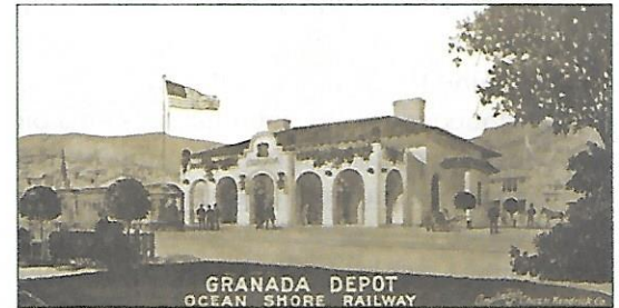
“Granada” was considered Ocean Shore’s “jewel” in its pearly necklace of beach towns