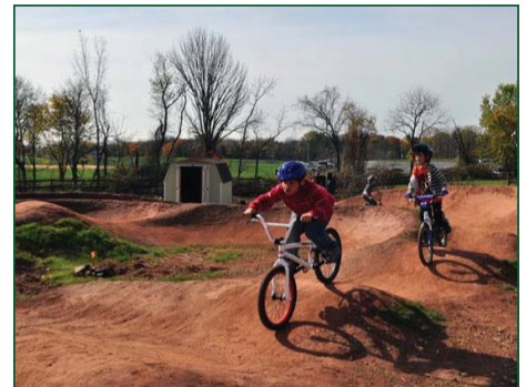
A bicycle pump track is a continuous loop of dirt berms and “rollers” (smooth dirt mounds). The rider’s upper and lower body’s pumping motion maintains the speed around the track, ideally without pedaling.

ment of a County Quarry Park Pump Track proposal. This will include outreach for potential collaboration with the SMC Parks Foundation, and considerations such as the pump track size and location, critical design elements, cost estimates, permit requirements and volunteer-supported building and maintenance.